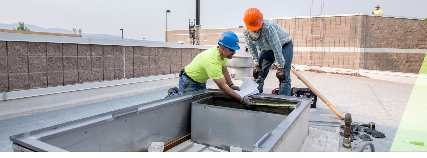
Post Falls, ID — On-site planning ensures proper placement of condensate line.