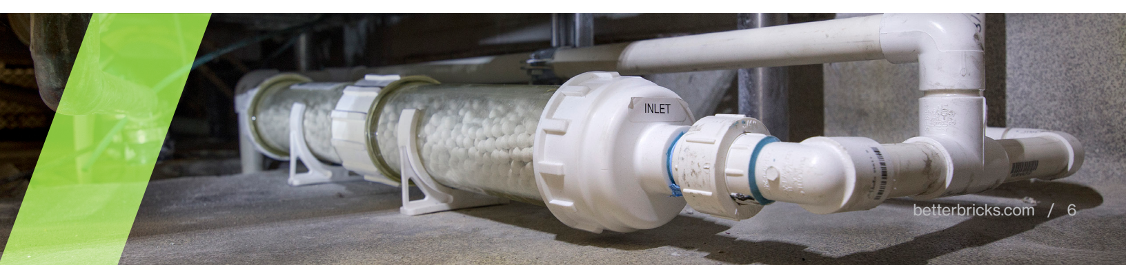
Post Falls, ID — Condensate neutralizer and overflow by-pass located just before a kitchen floor drain. Note the union fitting installed for easy servicing and replacement of neutralizer media.

The international plumbing code specifies that acidic, corrosive liquids should not be discharged into the plumbing system without being thoroughly diluted, neutralized or treated by passing through an approved dilution or neutralizing device. However, there is no indication that the condensate from gas-fired C-RTUs falls into this category. Regardless, the city IFGCs of Seattle and Portland specifically call for the neutralization of acidic condensate.