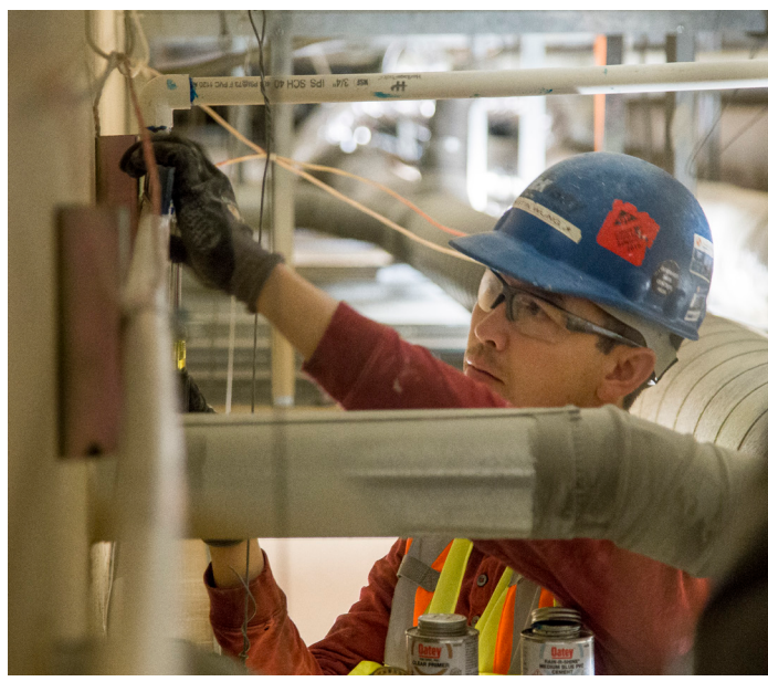
Renton, WA — PVC condensate line installation at a 2% (1/4-inch per foot) slope utilizing conventional hangars and unistrut supports.

The presence of nitric and sulfuric acids in the condensate can make it corrosive and therefore must be properly disposed of.