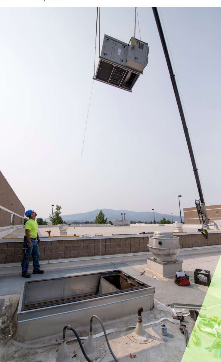
Post Falls, ID — Condensing RTU installed reusing the curb of the replaced unit.

In colder climates, winter temperatures can freeze condensate when piping is routed outside of the building. To avoid frozen condensate, it is advisable to route the drain line inside the building. Note that most manufacturer installation guides advise against routing the drain line to the roof. Where it is not possible to run the line inside the building, make sure the condensate is not allowed to collect in the pipe anywhere along its routing. Otherwise, freezing may occur before the condensate reaches its drain. Additionally, installers should use frost-free traps and heat trace along the pipe.